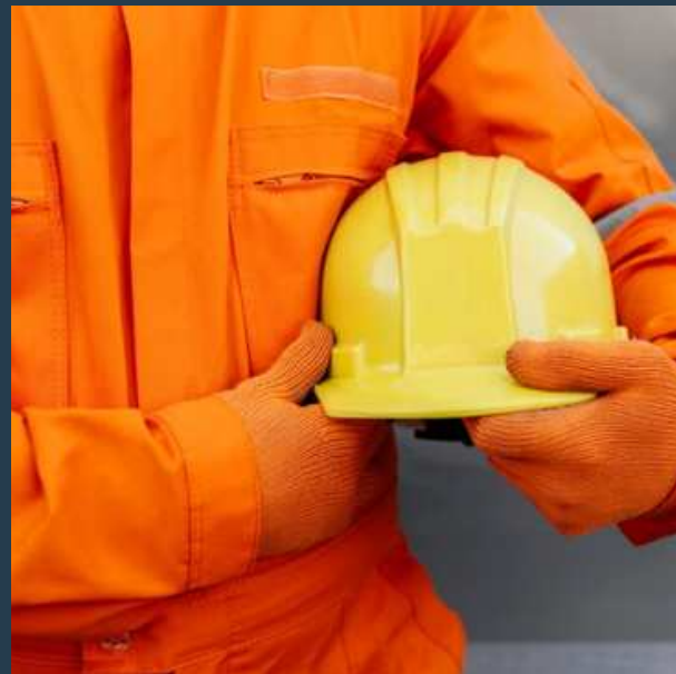
Mining and Industrial Supplies