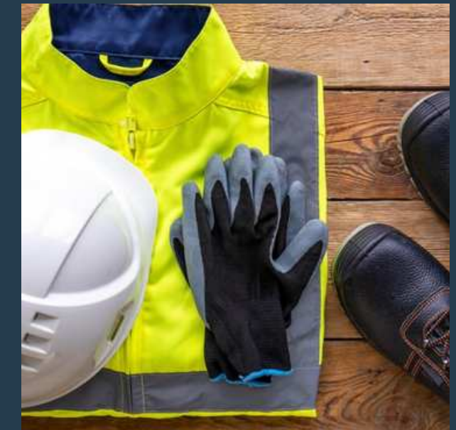
PPE & Safety Gear